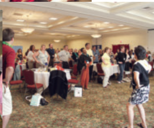
clockwise from upper left: The attendees of CVOP 2008. • The AMTA puzzle. Introduced at the March 2008 AMTA Board of Directors meeting, it represents how all the pieces of the association—individuals, chapters and National Office staff—come together to form a whole. • CVOPers dance it out at the end of an education session. • Chapter volunteers find out what’s new in Governance & Chapter Relations at Friday’s Program Fair. • A member learns more about AMTA’s web and database development at the Program Fair.